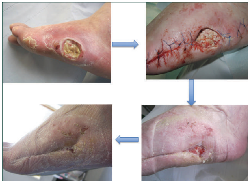
Figure 3: Clinical pictures showing a lateral midfoot ulcer progressing to complete healing following our protocol.

demonstrated serum levels that would be associated with any systemic toxicity. They have demonstrated an elution pattern that starts with a burst, which decreases with time and is maintained above minimum inhibitory concentration level for 4 weeks.