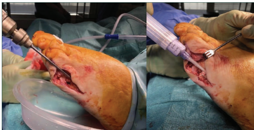
Figure 2: CERAMENT injection into metatarsals in forefoot infection by intramedullary retrograde filling.

biocomposite used was 5 ml, which contains 875 mg (175 mg/10 ml) of gentamicin. When possible, the wound was closed primarily without soft tissue tension or managed with dressings and vacuum-assisted closure. Patients were offloaded in a plaster or walking boot until complete wound healing.